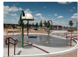
North Natomas Regional Park Spray Play area.

LIBRARY SUMMER READING ICE CREAM SOCIAL, SATURDAY JUNE 7TH FROM 2-4 PM.