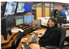
Sac PD ready to take your calls.

Program the Non-Emergency and Emergency phone numbers into your cell phone, and for quick access put an asterisk or two in front of the contact name so it is at the top of your contact list!